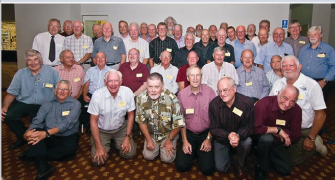
Photo from 2012 Reunion